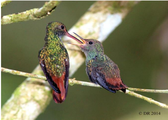
Rufous-tailed Hummingbird feeding its chick

Lunch was served in the dining area within the Lodge's main building. The room is covered but completely open-sided, maintaining the feeling of contact with the gardens and rainforest. There is also a comfortable lounge area with an extensive library (and WiFi) and a seating area which overlooks the bird tables and feeders. During our week's stay we would spend much time here, enjoying excellent meals, meeting new friends, exchanging highlights of each day and relaxing with a beer and the bird-list.