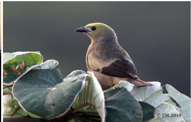
Palm Tanager in the early morning light

Tea and coffee are provided on the deck early each morning. The guides then come up to the deck as the light improves and the birds become active. They are highly skilled in spotting birds and setting up telescopes very quickly, ensuring that everyone has a chance to get good views of the birds. We certainly enjoyed some great birding each morning at the Tower.